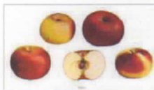
The Lady Apple

These are wonderful opportunities to share our Mill history and mission, to hear accounts from travelers of historic sites in their towns and to gather local stories from our community members.