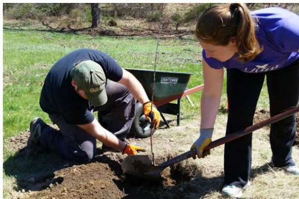
Planting apple trees.

We created homage to the apple orchard the Kimlins used to maintain: a mini orchard of 12 apple trees. In April, honoring Earth Day, volunteers helped us plant 6 Baldwin and 6 Honeycrisp apple trees.