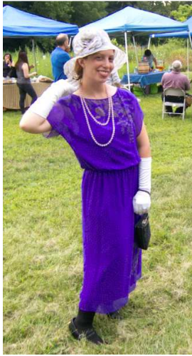
Tour guide dressed for the occasion.

Guests enjoyed light fare by Chocolate Mousse Catering, sipped summer cocktails, listened to 1920s-era music, played croquet, learned about the 100+ year history of the Kimlin family and Mill, and tried their luck at raffles!