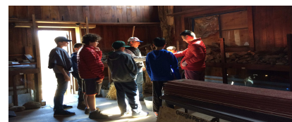
Todd Middle School volunteers using the corn sheller in Museum.

Over the years, Cider Mill Friends has provided a special place for community service opportunities to many students from our local schools and home schoolers. Schools include Todd Middle, Spackenkill High, Oakwood Friends, Our Lady of Lourdes, Dutchess Community College, SUNY New Paltz and Vassar College.